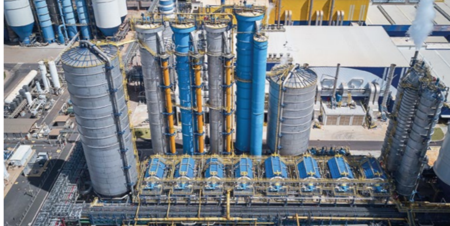
The new hardwood fiberline ensures low operating costs, low emissions, extremely high washing efficiency, and excellent fiber quality. The capacity (6,120 adt/d) is the highest in the world for a single fiberline.